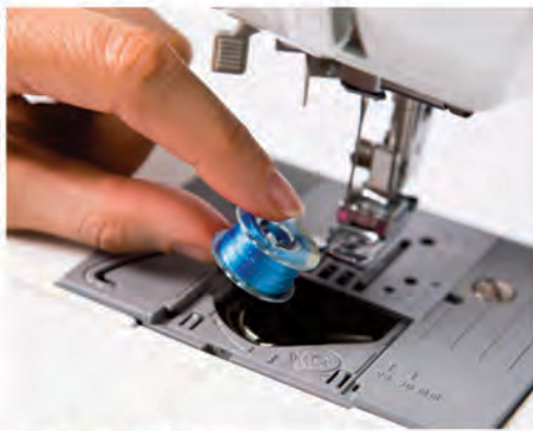
Quick set bobbin