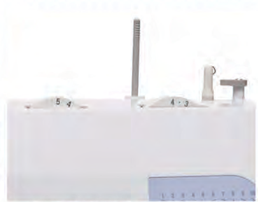
Stitch length and width control

Wide range of optional accessories available including quilting feet, etc. See your dealer or visit www.brother.com for details.